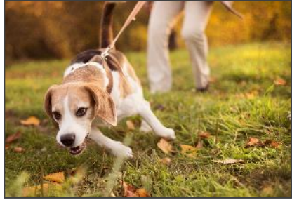
walk the dog