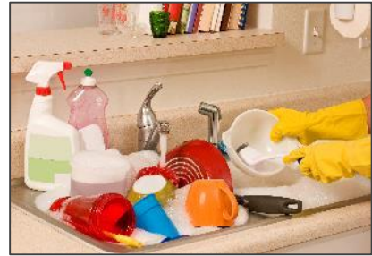
do the dishes