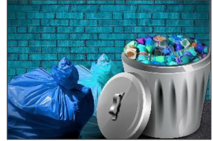
take out the trash