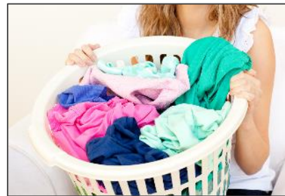
wash my clothes