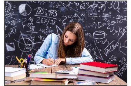
do my homework