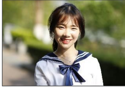
wear a uniform