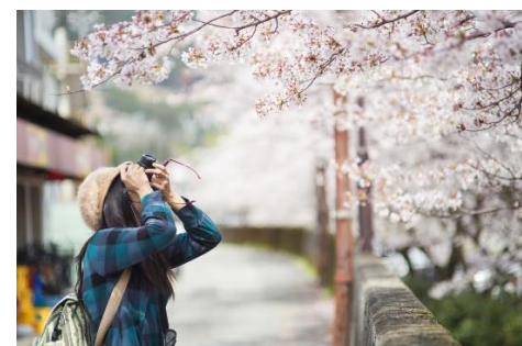
Kumi / vacation