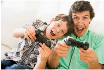
play video games