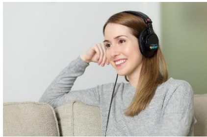
listen to music