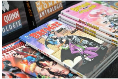
read comic books