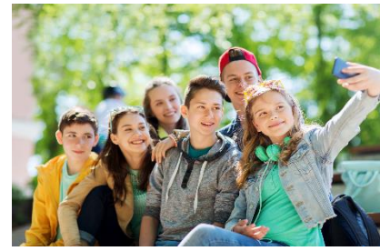
play with friends