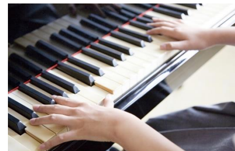
Julia / evenings