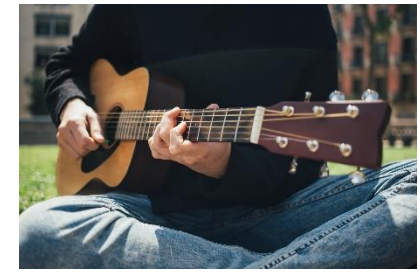
play an instrument